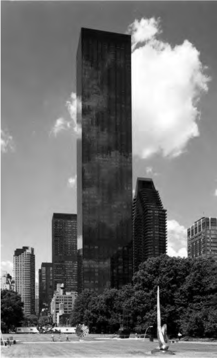
Trump World Tower at United Nations Plaza