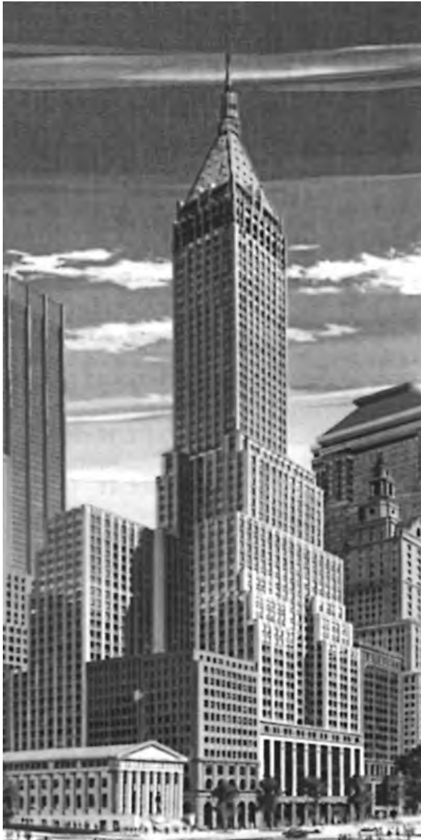
40 Wall Street